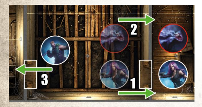
Figure 3: A Mist follows Magenta.

Follow: The Mist and Swarms of Bats surround Hunters, harassing their every endeavor and moving with them as the Hunters try to escape. If a Hunter moves away from an area that contains a Swarm that Follows, the Swarm will move with the Hunter to their final Destination. Move the Swarm immediately after the Hunter completes their Move and then continue with the Hunter's other Actions, if necessary.