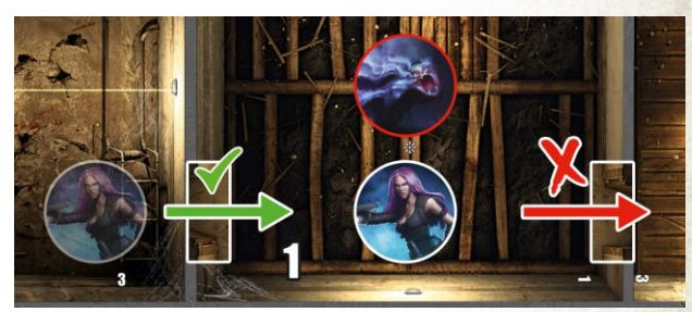
Figure 4: A Mist Enshrouds Magenta.

In Figure 3, Magenta Moves and then has 2 Actions left to use. She cannot Move again, because the Mist in her Area has the Enshroud ability and she has already Moved once. When Stephan Activates, there is no Mist in his Area, so he can use the Move Action as many times as he wants to.